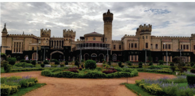
Bangalore Palace & Tipu Sultan's Summer Palace - Two pieces of the city's royal past.