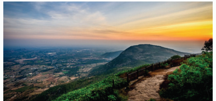
Day trips - Nandi Hills (sunrise drive), Bannerghatta National Park (wildlife safari), Mysuru (3 to 4 hrs by road).