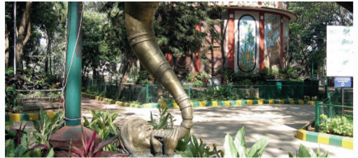
Bull Temple & Bugle Rock - Old Bengaluru atmosphere in Basavanagudi.