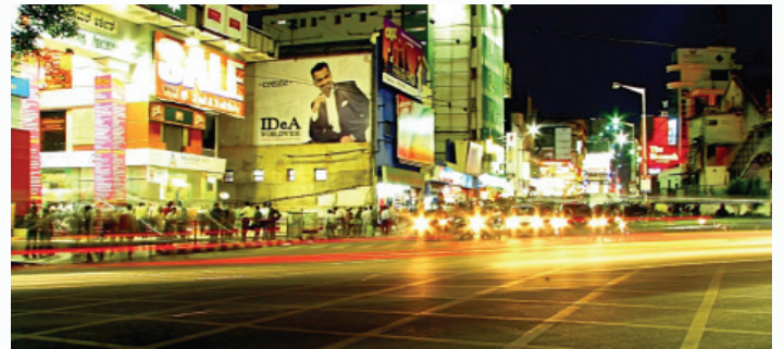
Commercial Street, Brigade Road, MG Road - Shopping & the colonial cantonment quarter; Chickpet for traditional silks.