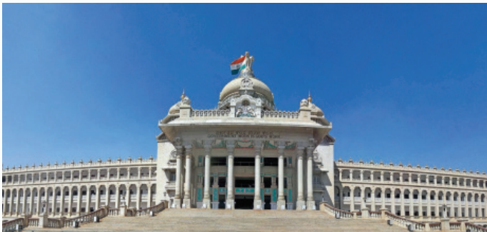
Cubbon Park & Vidhana Soudha - Walkable loop past the State Secretariat and High Court.