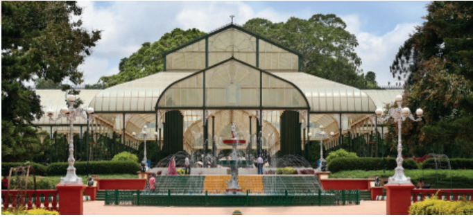
Lalbagh Botanical Garden - 240-acre park; the Glass House and rose garden at sunrise.